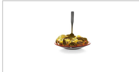
Decoding the diabetic diet