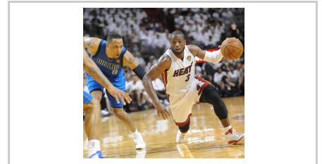
Dwyane Wade's ex-wife drops suit